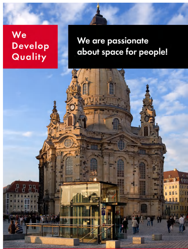
Figure 12: Accessible city centre of Dresden