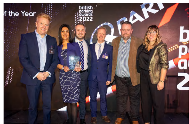
Figure 26: BPA Award - Parking operator of the year

Q-Park UK won the prestigious BPA ‘Parking operator of the year’ award. The judges consider many facets of the parking operator’s ongoing operations ranging from the internal organisation and consistent good practice, to partnerships and customer service.