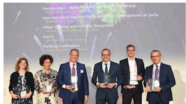
Figure 25: EPA Award - Digital partnerships solution

Click here to view the winning Q-Park Digital Partnerships presentation.