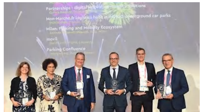
Figure 25: EPA Award - Digital partnerships solution

Click here to view the winning Q-Park Digital Partnerships presentation.