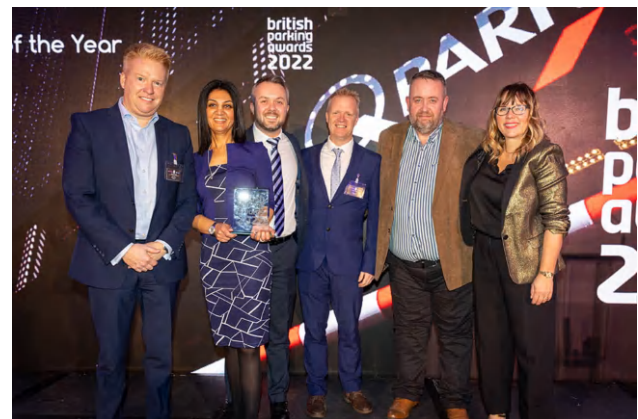
Figure 26: BPA Award - Parking operator of the year

Q-Park UK won the prestigious BPA ‘Parking operator of the year’ award. The judges consider many facets of the parking operator's ongoing operations ranging from the internal organisation and consistent good practice, to partnerships and customer service.