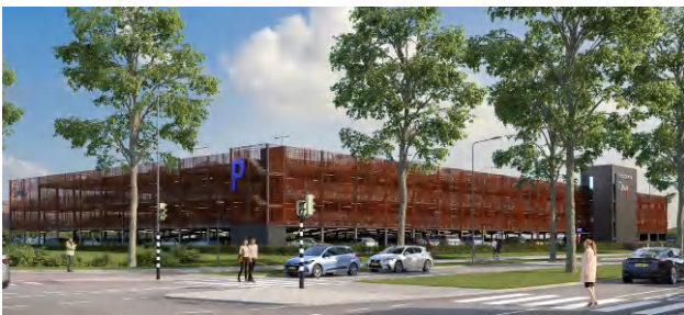
Figure 5: Maastricht Frontenpark impression