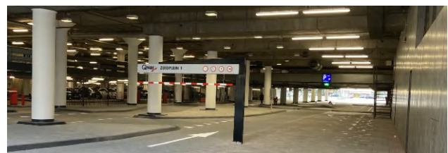
Figure 6: Rotterdam Zuidplein well-lit walkway

For this ongoing redevelopment, Rotterdam municipality is working together with developers and construction companies. The aim is to create a community centre for the south of Rotterdam with many amenities where people can live, work and relax in pleasant surroundings. Pedestrian safety as well as sufficient car parking capacity is an important part of this development.