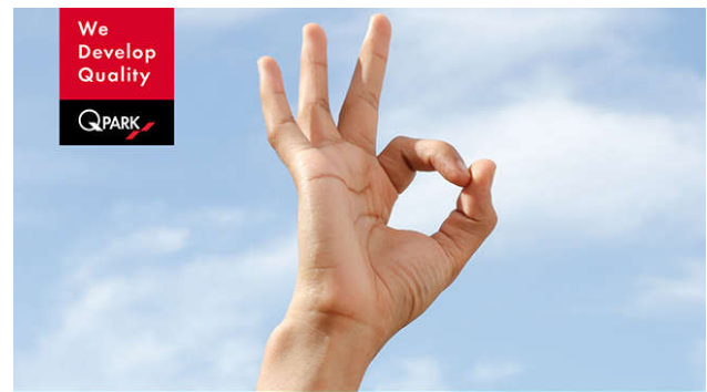
Figure 10: Variety of support services

Our aim is to foster mobility and enable access to essential urban functions in conjunction with sustainability concerns.